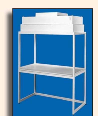
Vertical Flow Clean Bench