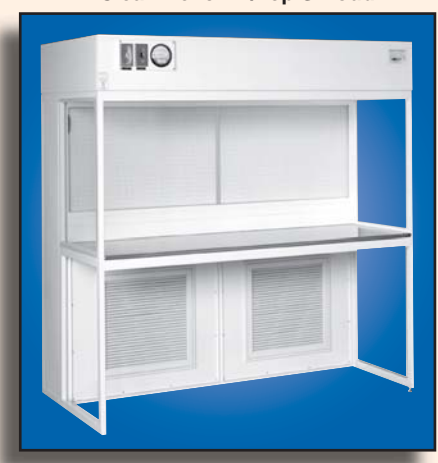
Front Intake Horizontal Flow Clean Bench w/Top Shroud