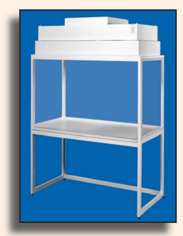
E-Series Vertical Flow Clean Bench w/Acrylic Back and Side Panels

A variety of factory-installed options are available; or units can be customized to meet your unique requirements.