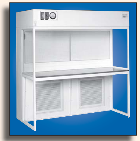
Front Intake Horizontal Flow Clean Bench w/Top Shroud