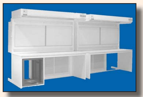
Modular Horizontal Flow Clean Bench

Consult with your area representative or our factory on your next project.