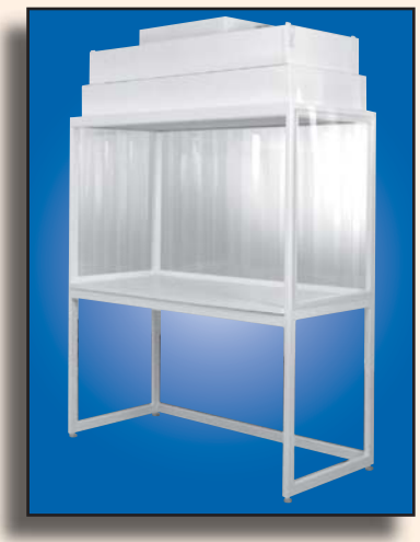
E Series Vertical Flow w/vinyl Strip Curtain